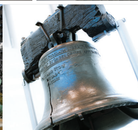
Liberty bell; Independence Hall, blue sky